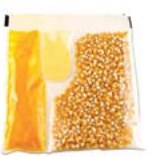
Portion Pack available in 6 oz, 8 oz, 12 oz